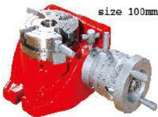
Rotary table 75mm SA102450