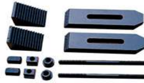
Clamping Kit 12pcs Bolt size SA101040