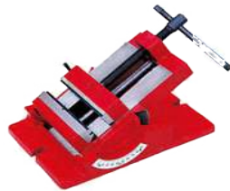
Vice with angle SA101330