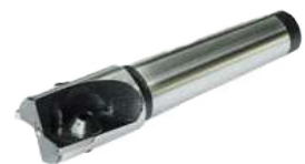
Indexable carbide end mill 16mm MT2 SA100710