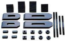
Clamping Kit 24 pcs Bolt size 6mm SA101050