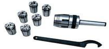
Mill chuck set SA100700