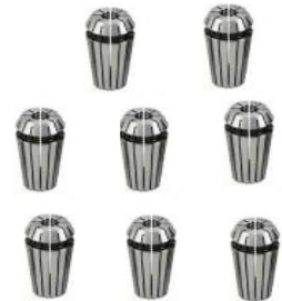
ER16 Collets set Metric set SA102820 Imperial set SA102825