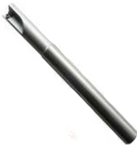
End Mill insert type diameter 16mm CTMEMIAJU C16-16-130