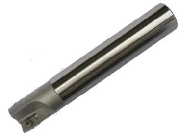
End Mill insert type diameter 20mm CTMEMIAJU C20-20-150