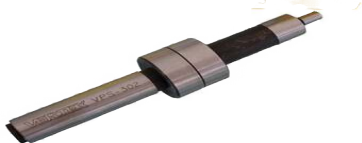
EDGE FINDER CE-420