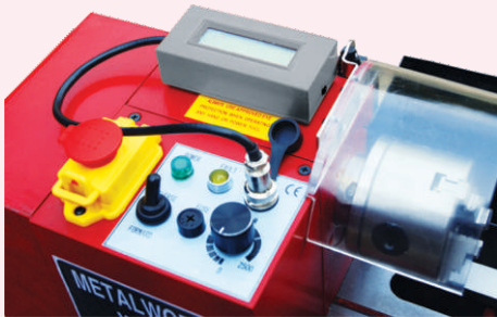
Optional Digital RPM readout