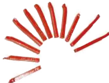
Cutter set SA102130