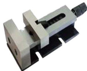
Quick vice SA100360