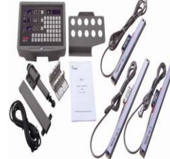
3 axis digital readout SA202320