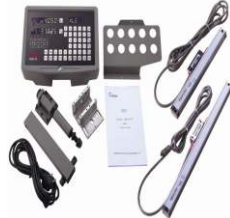
2 Axis digital readout SA202310