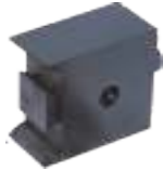
Tool post SA102121