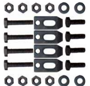
Clamping kit for SA102070 SA100235