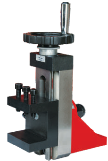
Mill attachment SA102080