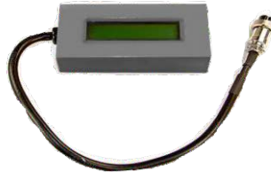
Digital spindle Speed readout SA100300