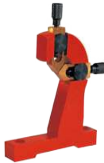
Follow rest SA102060