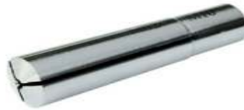
MT#3 Collet SA101190