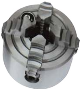
4 jaw chuck (self centering) SA102100 Chuck with flange SA102105