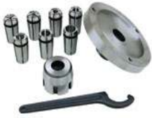
Mill chuck set SA102110