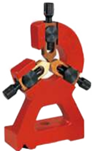
Steady rest SA102050