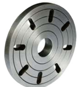
Face plate SA102070