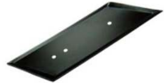
Oil tray SA102200