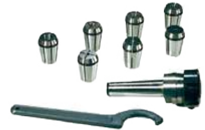
Mill chuck set SA100370