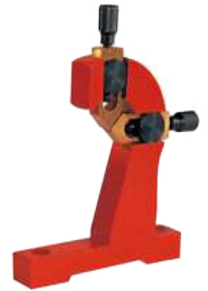
Follow rest SA101610