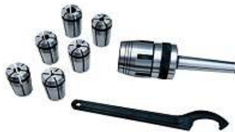
Mill chuck set SA100700