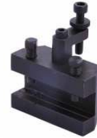
Cutter holder SA101682