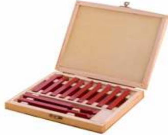
Cutter 11 pcs set with wooden box SA101980