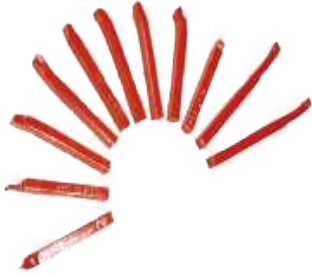
Cutter 11 pcs set SA100220