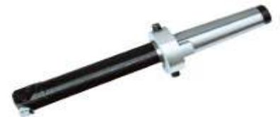
Boring arbor with boring cutter SA101170 MT2