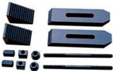
Clamping kit 12pcs SA101040