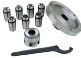
Mill chuck set SA101670