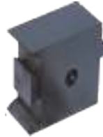
Tool post SA101681