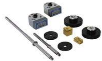
DRCD kit SA101650