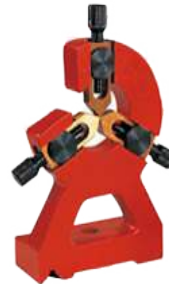
Steady rest SA101600