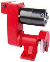
Grinding attachment SA101310