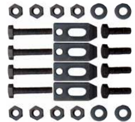
Clamping kit for face place SA101625