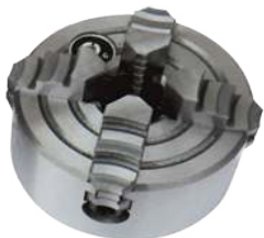
4 Jaw chuck (independent) SA100290