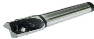
Indexable carbide end mill SA100710 MT2