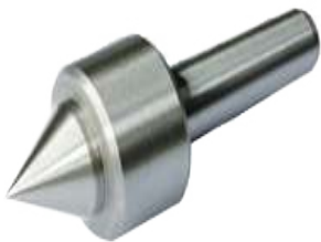
Rolling Center MT#2 SA100930