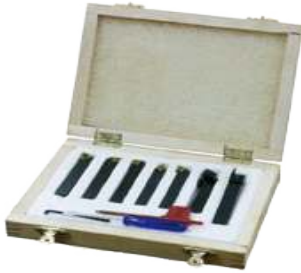
Cutter set 7 pcs Tin coated SA102000