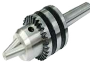
Tailstock chuck 13mm only for KC4S SA100270